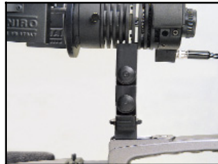
ALADINO with hinged arm mount