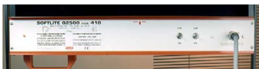
Switches panel (Independent switching for each lamp.)