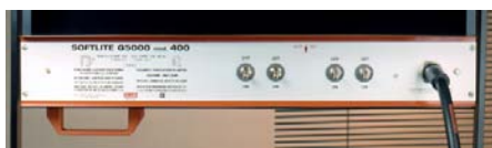
Switches panel (Independent switching for each lamp.)